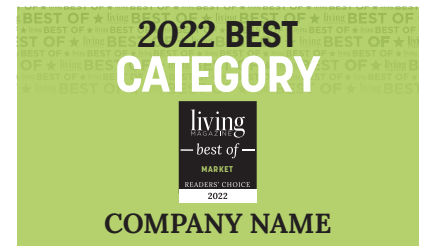
3' X 5' VINYL VICTORY BANNER $175

Product images are for illustrative purposes only and may differ from the actual product. Shipping cost and sales tax are not included in the published price.