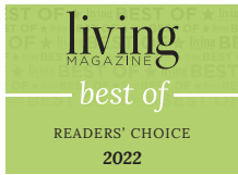
9 X 12 WINDOW CLING $25