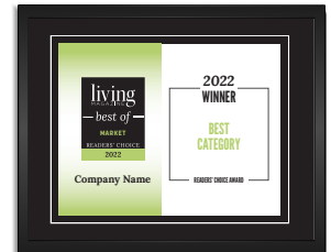
15 X 16 ONE-PANEL BLACK FRAME UNDER GLASS $250