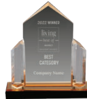
7 X 8 CRYSTAL-STYLE AWARD $195