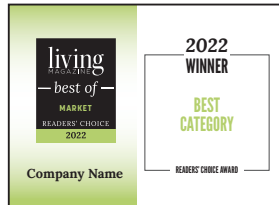
9 X 12 WALL PLAQUE $175