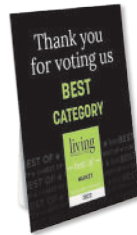
8 X 10 COUNTER CARD $40